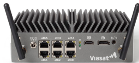
Figure 3: Rear View